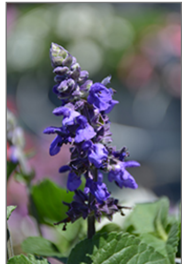
Big Blue Salvia flowers