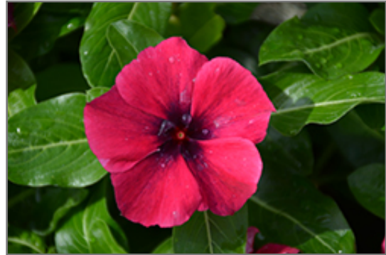
Tattoo Black Cherry Vinca flowers

This plant will require occasional maintenance and upkeep, and should not require much pruning, except when necessary, such as to remove dieback. It is a good choice for attracting butterflies to your yard, but is not particularly attractive to deer who tend to leave it alone in favor of tastier treats. It has no significant negative characteristics.