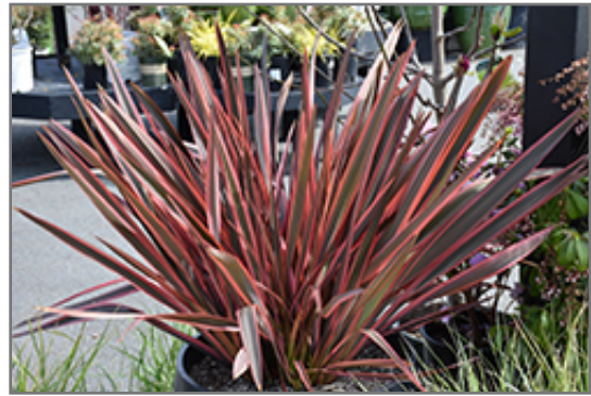
Rainbow Chief New Zealand Flax

Rainbow Chief New Zealand Flax is recommended for the following landscape applications;