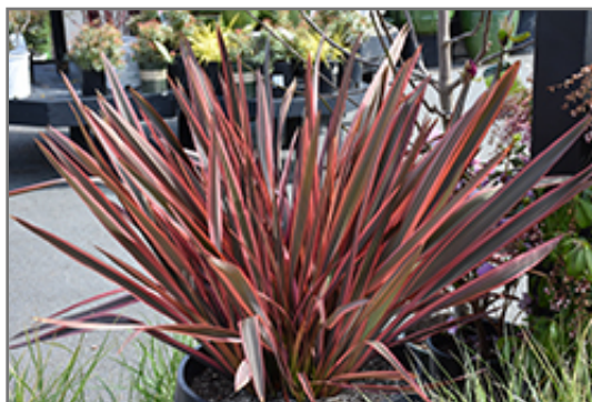
Rainbow Chief New Zealand Flax

Rainbow Chief New Zealand Flax is recommended for the following landscape applications;