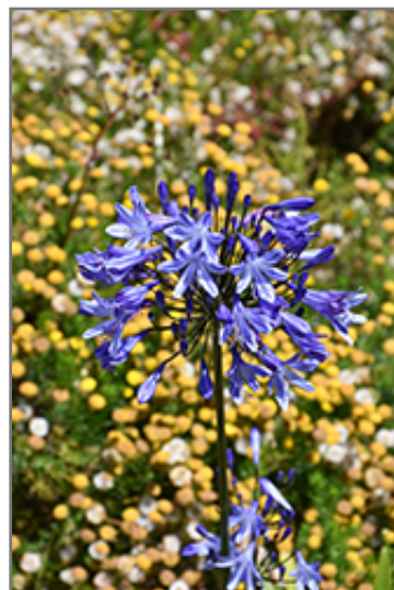
Blue Leap Agapanthus flowers

Blue Leap Agapanthus is recommended for the following landscape applications;