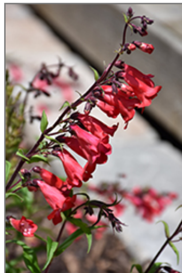
Cherry Sparks Beard Tongue flowers