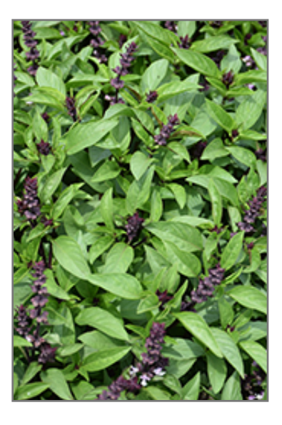
Clove Basil foliage

An upright, dense variety that is a common culinary herb in West Africa and the Caribbean; pale pink and white flowers with purple calyces rise up in mid-summer; great for mixed containers, herb gardens, and annual beds