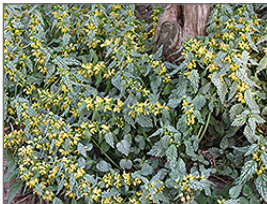
Hermann's Pride Yellow Archangel in bloom

Hermann's Pride Yellow Archangel will grow to be about 12 inches tall at maturity, with a spread of 18 inches. Its foliage tends to remain dense right to the ground, not requiring facer plants in front. It grows at a medium rate, and under ideal conditions can be expected to live for approximately 10 years. As an herbaceous perennial, this plant will usually die back to the crown each winter, and will regrow from the base each spring. Be careful not to disturb the crown in late winter when it may not be readily seen!