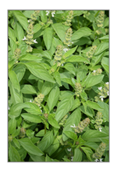
Lime Basil foliage

Lime Basil will grow to be about 20 inches tall at maturity, with a spread of 20 inches. When grown in masses or used as a bedding plant, individual plants should be spaced approximately 16 inches apart. This fast-growing annual will normally live for one full growing season, needing replacement the following year.