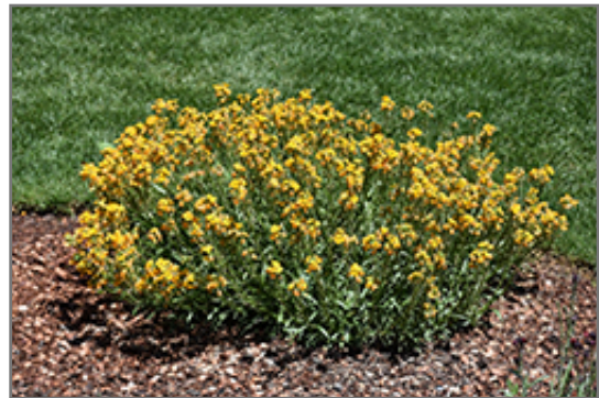
Cheers Florange Wallflower in bloom