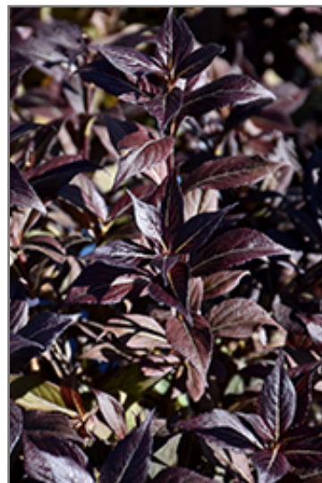
Date Night Stunner Weigela foliage