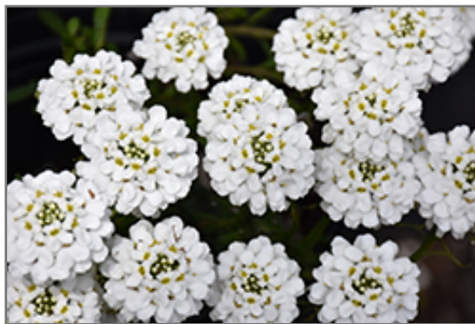
Snowsunder Forte Candytuft flowers