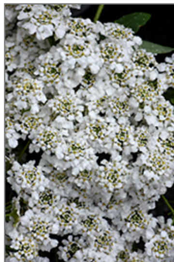
Snowsunder Forte Candytuft flowers

Snowsunder Forte Candytuft is recommended for the following landscape applications;