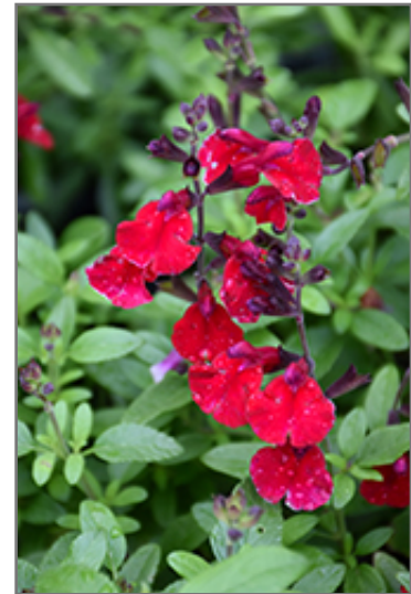
Mirage Cherry Red Autumn Sage flowers

This is a relatively low maintenance plant, and should only be pruned after flowering to avoid removing any of the current season's flowers. It is a good choice for attracting bees, butterflies and hummingbirds to your yard, but is not particularly attractive to deer who tend to leave it alone in favor of tastier treats. It has no significant negative characteristics.