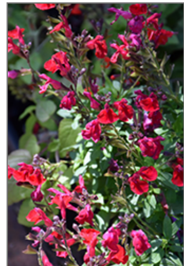
Mirage Cherry Red Autumn Sage flowers