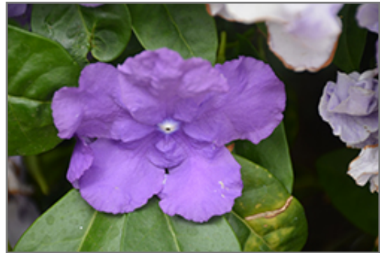
Yesterday Today And Tomorrow flowers

Yesterday Today And Tomorrow is recommended for the following landscape applications;