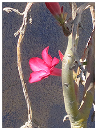
Desert Rose flowers