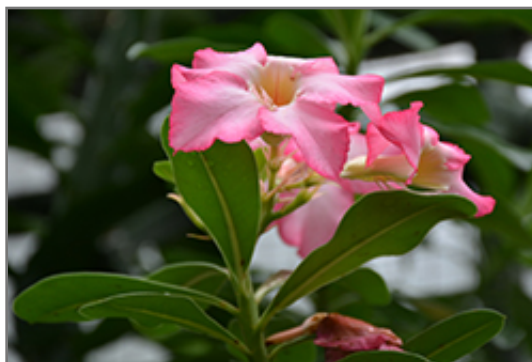
Desert Rose flowers