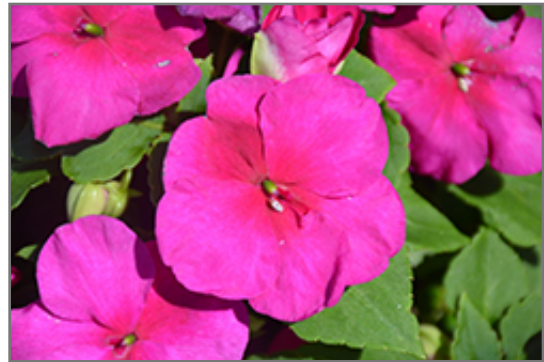
Super Elfin Ruby Impatiens in bloom