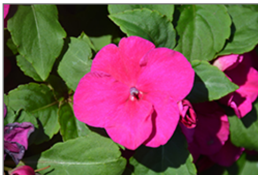
Accent Premium Violet Impatiens flowers

Accent Premium Violet Impatiens is recommended for the following landscape applications;