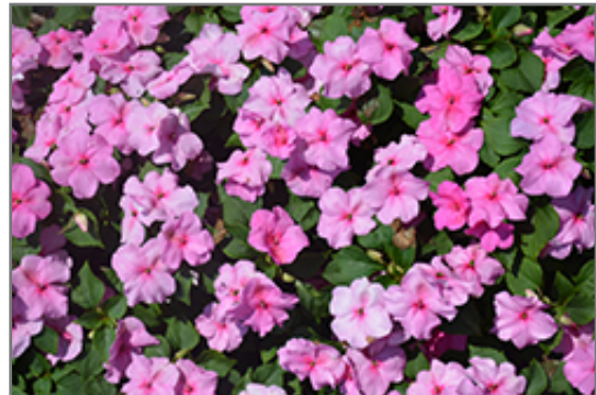
Accent Premium Pink Impatiens flowers