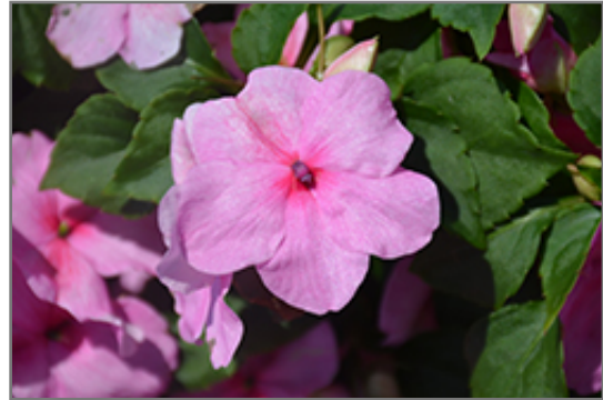
Accent Premium Pink Impatiens flowers

Accent Premium Pink Impatiens is recommended for the following landscape applications;