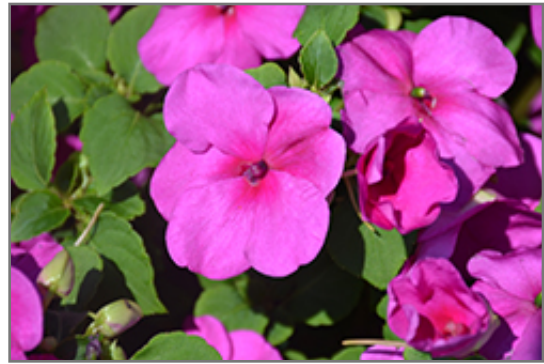
Accent Premium Lilac Impatiens flowers