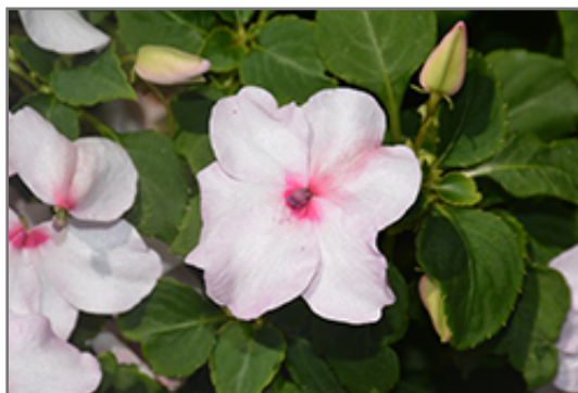
Accent Premium Bright Eye Impatiens flowers