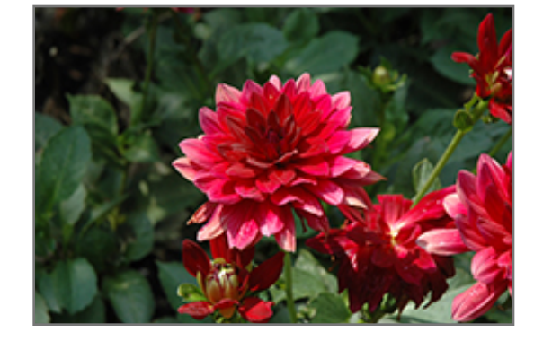
XXL Taxco Red Dahlia flowers