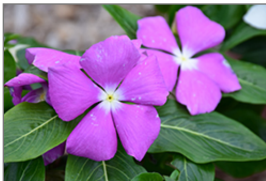
Mega Bloom Deep Lavender Vinca flowers

Mega Bloom Deep Lavender Vinca is recommended for the following landscape applications;