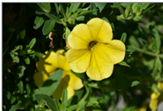
MiniFamous Neo Deep Yellow Calibrachoa flowers

This plant will require occasional maintenance and upkeep. Trim off the flower heads after they fade and die to encourage more blooms late into the season. It is a good choice for attracting bees and hummingbirds to your yard, but is not particularly attractive to deer who tend to leave it alone in favor of tastier treats. It has no significant negative characteristics.