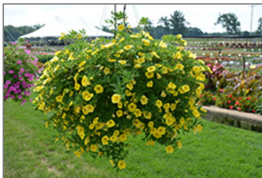
MiniFamous Neo Deep Yellow Calibrachoa in bloom

MiniFamous Neo Deep Yellow Calibrachoa will grow to be about 15 inches tall at maturity, with a spread of 15 inches. When grown in masses or used as a bedding plant, individual plants should be spaced approximately 12 inches apart. Its foliage tends to remain dense right to the ground, not requiring facer plants in front. This fast-growing annual will normally live for one full growing season, needing replacement the following year.