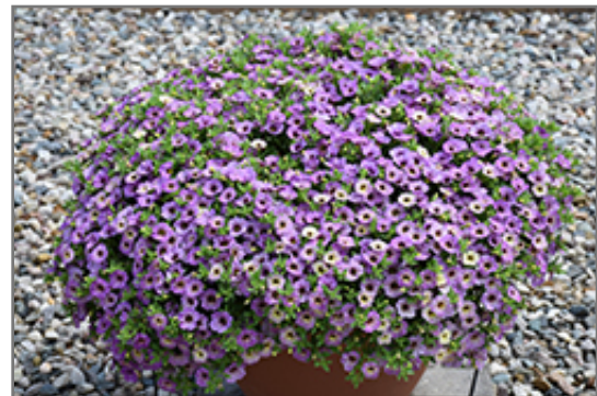
Chameleon Plum Cobbler Calibrachoa in bloom