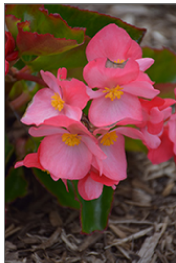
Megawatt Rose Green Leaf Begonia flowers