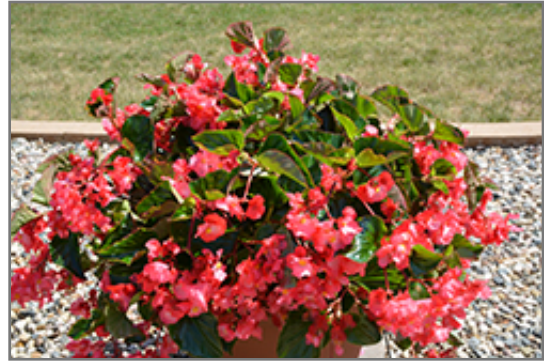
Megawatt Rose Green Leaf Begonia in bloom