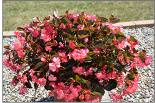
Megawatt Pink Bronze Leaf Begonia in bloom