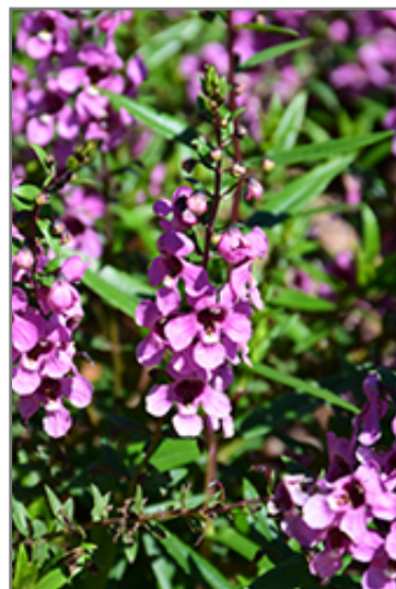
Sungelonia Pink Angelonia flowers

Sungelonia Pink Angelonia is recommended for the following landscape applications;