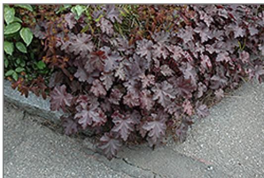
Stormy Seas Coral Bells

Stormy Seas Coral Bells is recommended for the following landscape applications;