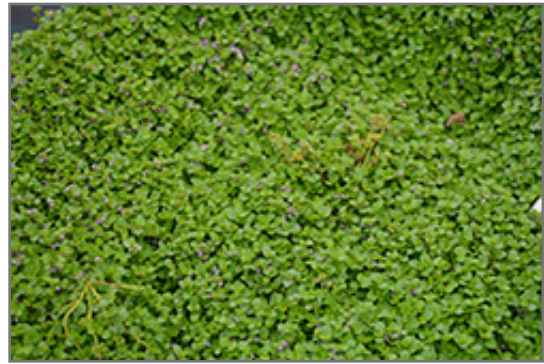
Mini Mint Ornamental Mint

Mini Mint Ornamental Mint is recommended for the following landscape applications;