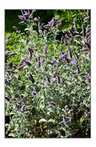
Horse Mint flowers