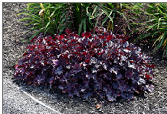
Plum Pudding Coral Bells

Plum Pudding Coral Bells will grow to be only 6 inches tall at maturity extending to 12 inches tall with the flowers, with a spread of 12 inches. When grown in masses or used as a bedding plant, individual plants should be spaced approximately 10 inches apart. Its foliage tends to remain low and dense right to the ground. It grows at a medium rate, and under ideal conditions can be expected to live for approximately 10 years. As an evergreen perennial, this plant will typically keep its form and foliage year-round.