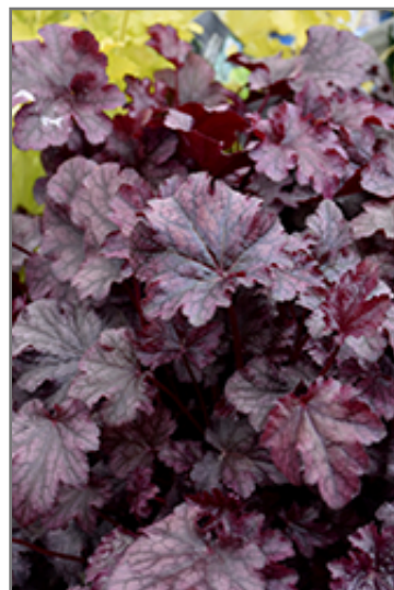
Plum Pudding Coral Bells foliage

Plum Pudding Coral Bells is recommended for the following landscape applications;