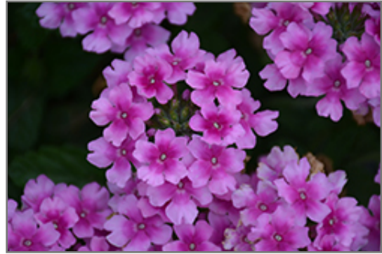
EnduraScape Pink Bicolor Verbena flowers

This plant will require occasional maintenance and upkeep. Trim off the flower heads after they fade and die to encourage more blooms late into the season. Deer don't particularly care for this plant and will usually leave it alone in favor of tastier treats. It has no significant negative characteristics.