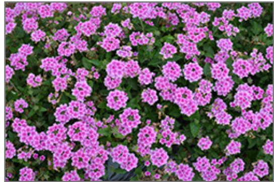
EnduraScape Pink Bicolor Verbena flowers