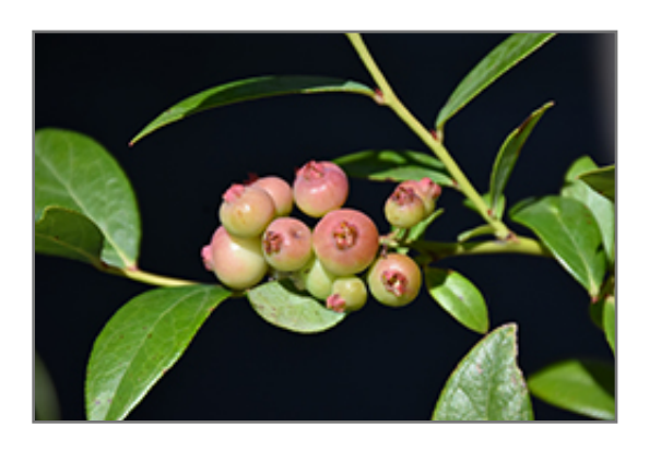
Pink Lemonade Blueberry fruit