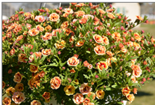
MiniFamous Double Orange Strike Calibrachoa in bloom

MiniFamous Double Orange Strike Calibrachoa is a fine choice for the garden, but it is also a good selection for planting in outdoor containers and hanging baskets. Because of its trailing habit of growth, it is ideally suited for use as a 'spiller' in the 'spiller-thriller-filler' container combination; plant it near the edges where it can spill gracefully over the pot. Note that when growing plants in outdoor containers and baskets, they may require more frequent waterings than they would in the yard or garden.