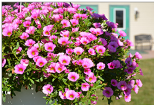
Can-Can Pink Flamingo Calibrachoa in bloom