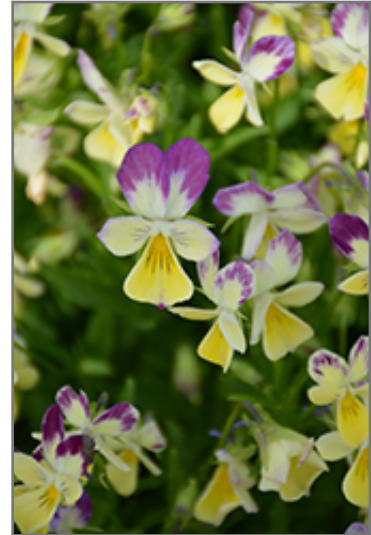
Hip Hop Honeybunny Pansy flowers