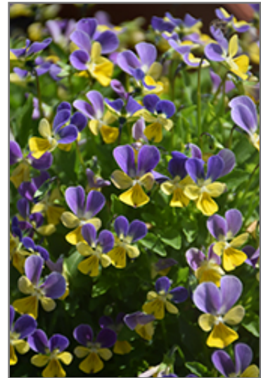
Hip Hop Bluebunny Pansy flowers