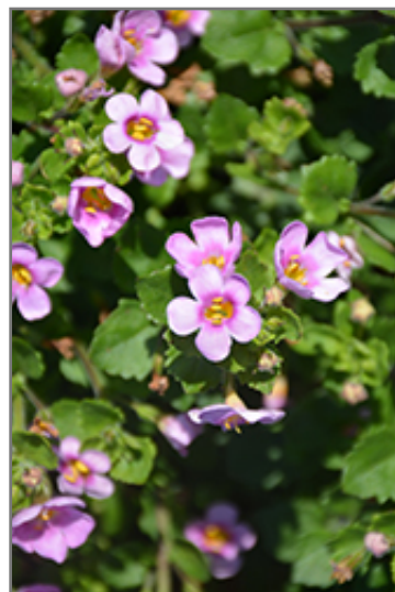
Boutique Pink Mascara Bacopa flowers

Boutique Pink Mascara Bacopa is recommended for the following landscape applications;