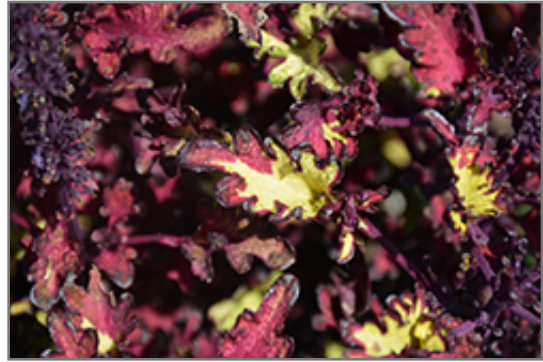
Under the Sea Sea Monkey Rust Coleus foliage