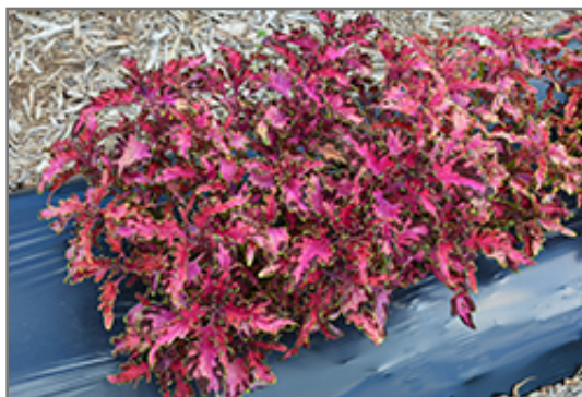
Under The Sea Pink Reef Coleus