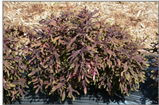
Under The Sea Lion Fish Coleus