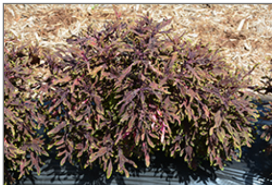
Under The Sea Lion Fish Coleus