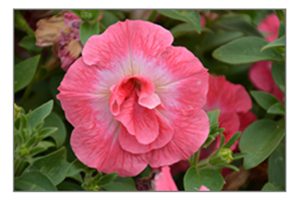
Panache Double Trouble Petunia flowers

Panache Double Trouble Petunia is recommended for the following landscape applications;