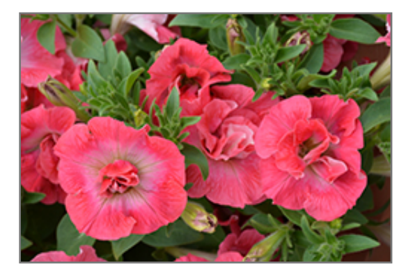
Panache Double Trouble Petunia flowers

Moana Lane Garden Center & Corporate Office South Virginia St. Garden Center 1100 W. Moana Lane Reno, NV 89509 (775) 825-0600 (775) 825-0602 - Corporate Office