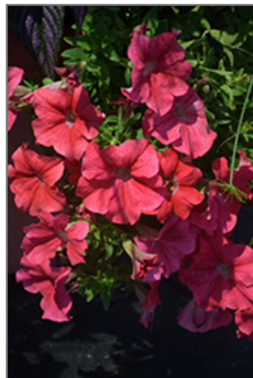
Panache Coral Reef Petunia flowers