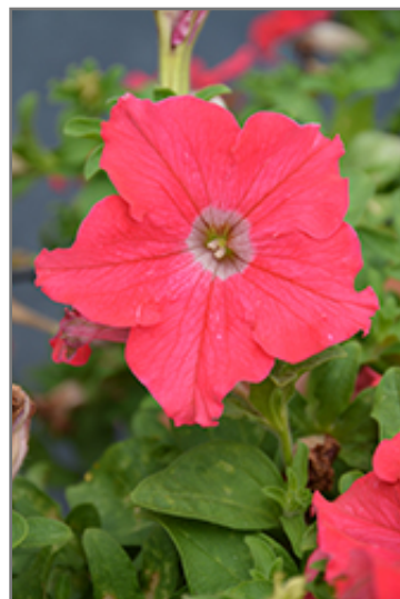
Panache Coral Reef Petunia flowers

Panache Coral Reef Petunia is recommended for the following landscape applications;