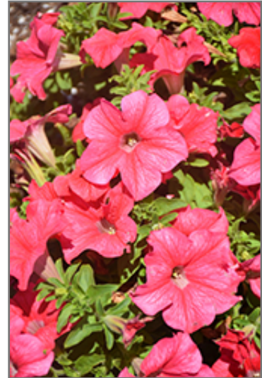
Panache Coral Reef Petunia flowers

Panache Coral Reef Petunia is a fine choice for the garden, but it is also a good selection for planting in outdoor containers and hanging baskets. It is often used as a 'filler' in the 'spiller-thriller-filler' container combination, providing a mass of flowers against which the thriller plants stand out. Note that when growing plants in outdoor containers and baskets, they may require more frequent waterings than they would in the yard or garden.