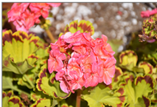
Glitterati Diva Queen Geranium flowers

Glitterati Diva Queen Geranium is recommended for the following landscape applications;