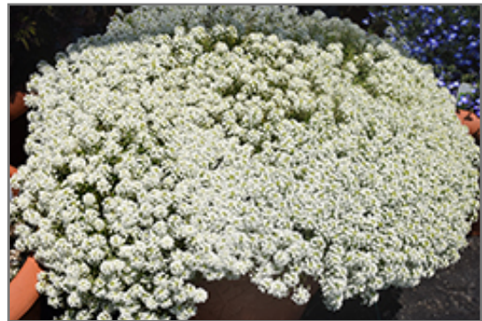
Snow Globe Alyssum in bloom