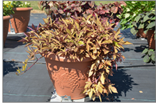
South of the Border Refried Beans Sweet Potato Vine

South of the Border Refried Beans Sweet Potato Vine will grow to be about 8 inches tall at maturity, with a spread of 3 feet. When grown in masses or used as a bedding plant, individual plants should be spaced approximately 12 inches apart. Its foliage tends to remain low and dense right to the ground. This fast-growing annual will normally live for one full growing season, needing replacement the following year.