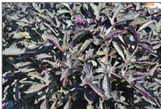
South of the Border Black Beans Sweet Potato Vine foliage