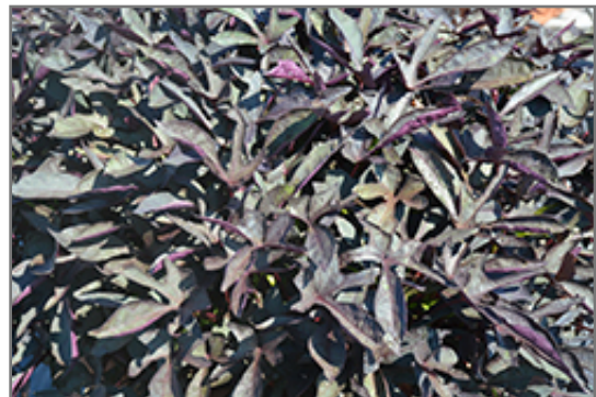
South of the Border Black Beans Sweet Potato Vine foliage

Moana Lane Garden Center & Corporate Office 1100 W. Moana Lane Reno, NV 89509 (775) 825-0600 (775) 825-0602 - Corporate Office