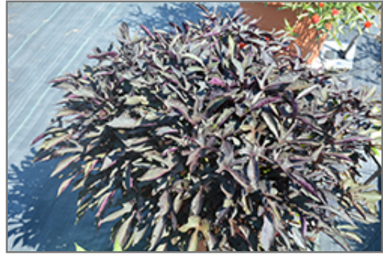
South of the Border Black Beans Sweet Potato Vine

South of the Border Black Beans Sweet Potato Vine will grow to be about 8 inches tall at maturity, with a spread of 3 feet. When grown in masses or used as a bedding plant, individual plants should be spaced approximately 12 inches apart. Its foliage tends to remain low and dense right to the ground. This fast-growing annual will normally live for one full growing season, needing replacement the following year.