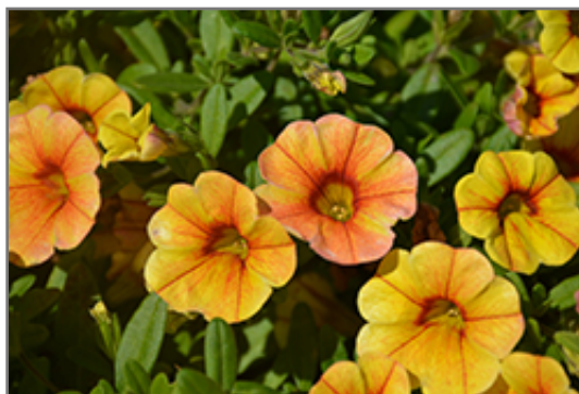
Kimono Tokyo Sunset Calibrachoa flowers

Kimono Tokyo Sunset Calibrachoa is recommended for the following landscape applications;