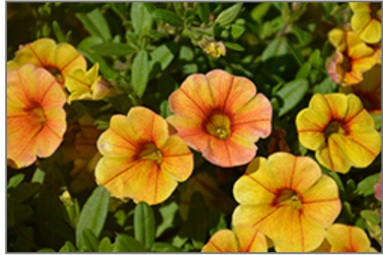
Kimono Tokyo Sunset Calibrachoa flowers

Kimono Tokyo Sunset Calibrachoa is recommended for the following landscape applications;