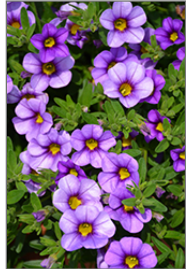
Kimono Blue Dragon Calibrachoa flowers

Kimono Blue Dragon Calibrachoa is recommended for the following landscape applications;