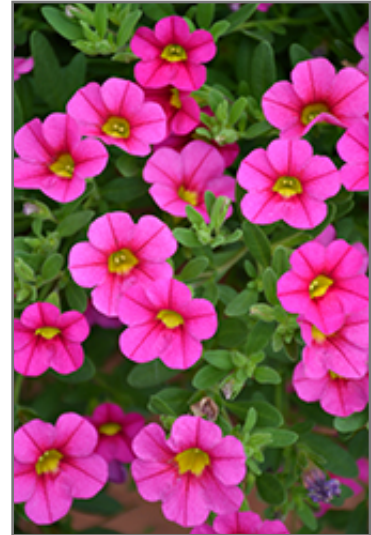
Catwalk Lipstick Pink Calibrachoa flowers

Catwalk Lipstick Pink Calibrachoa is recommended for the following landscape applications;