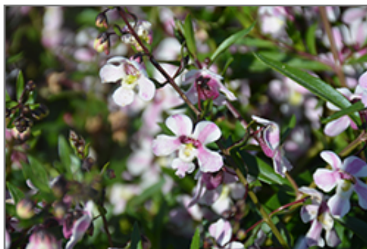
Pinstripe Vintage Pink Angelonia flowers